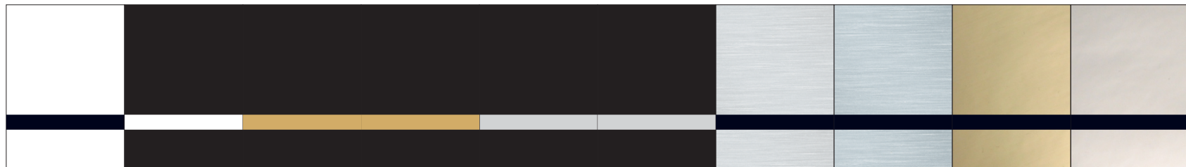
602-204 White/Black 602-402 Black/White 602-417 Matte Black/Brass 602-427 ■ Gloss Black/Brass 602-413 Matte Black/Silver 602-423 ■ Gloss Black/Silver 602-354 Brushed Alum./Black 602-334 Br. Silver/Black 602-794 ■ Trophy Gold/Black 602-394 ■ Trophy Silver/Black