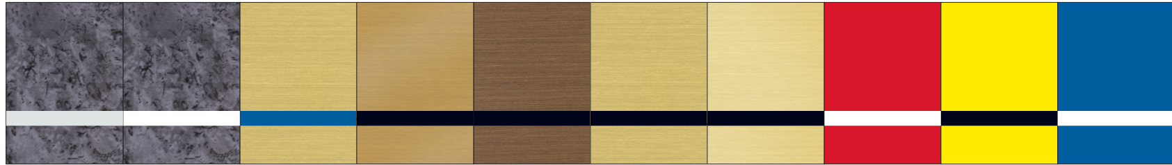
602-363 Harbor Grey/Silver 602-362 Harbor Grey/White 602-735 Brushed Gold/Blue 602-874 Brushed Bronze/Black 602-884 Deep Bronze/Black 602-734 Brushed Gold/Black 602-754 ♦ European Gold/Black 602-602 Red/White 602-744 Yellow/Black 602-512 Blue/White