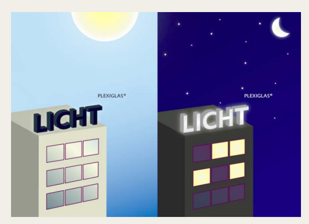
Fig. 2: Daytime and nighttime effect

Special-effect luminous walls in architecture